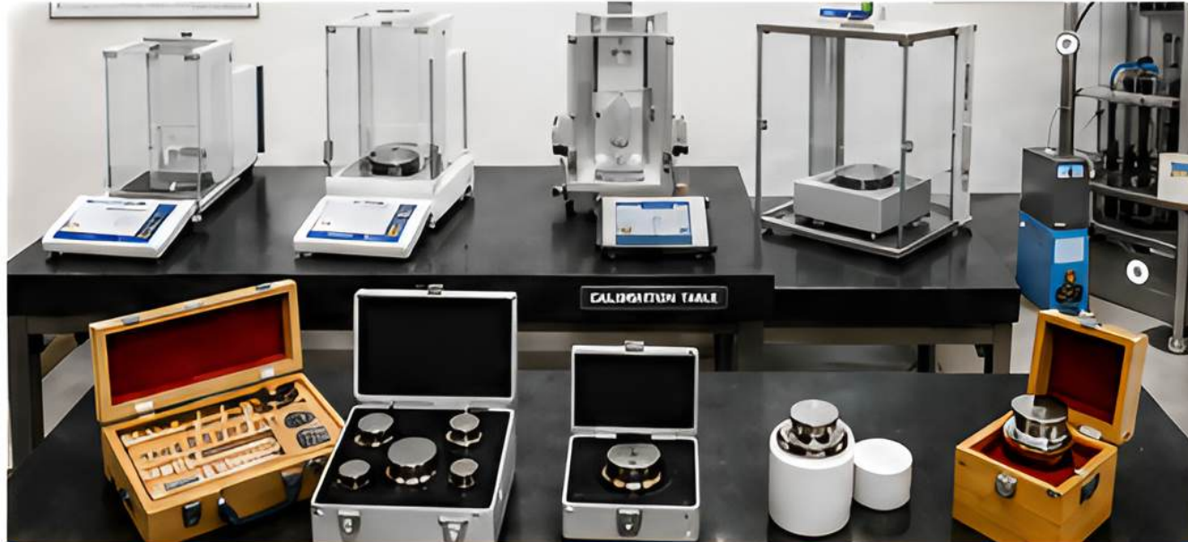
Mass and Volume Calibration Lab.