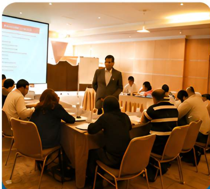
TRAINING & CERTIFICATION