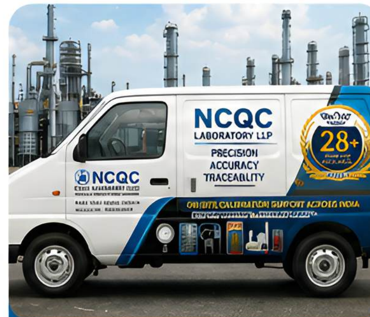
CALIBRATION SERVICE VEHICLE