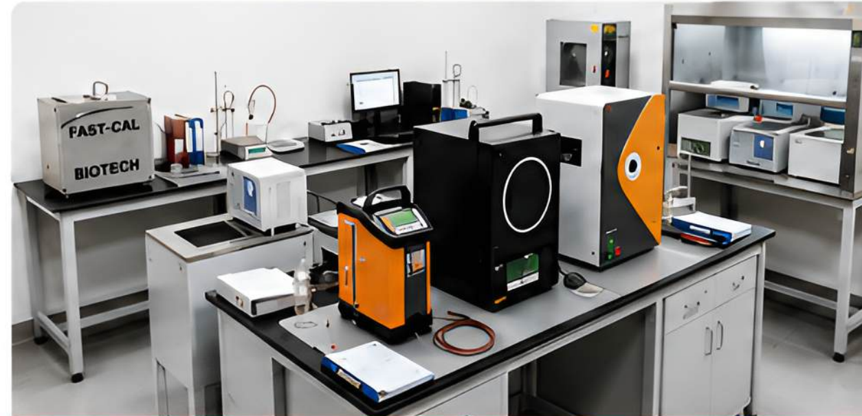
Thermal Calibration Laboratory