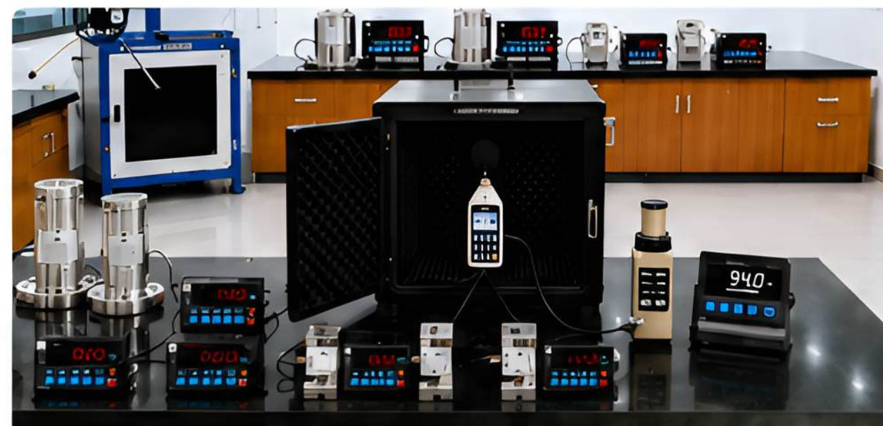
Force and Torque Laboratory