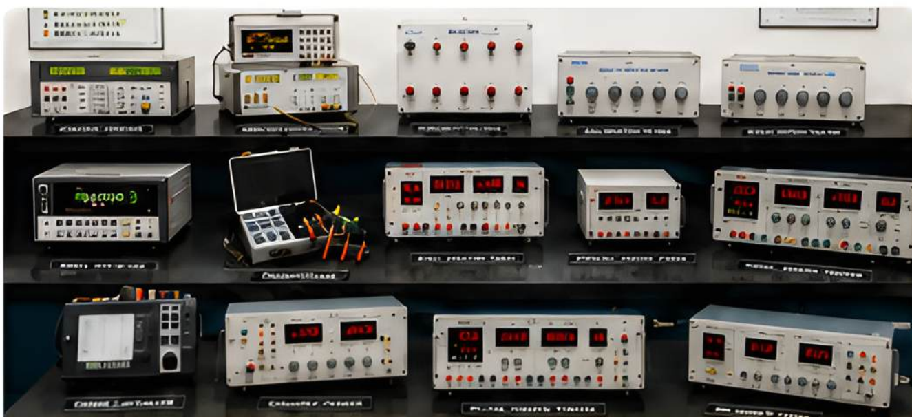
Electro-Technical Calibration Lab.